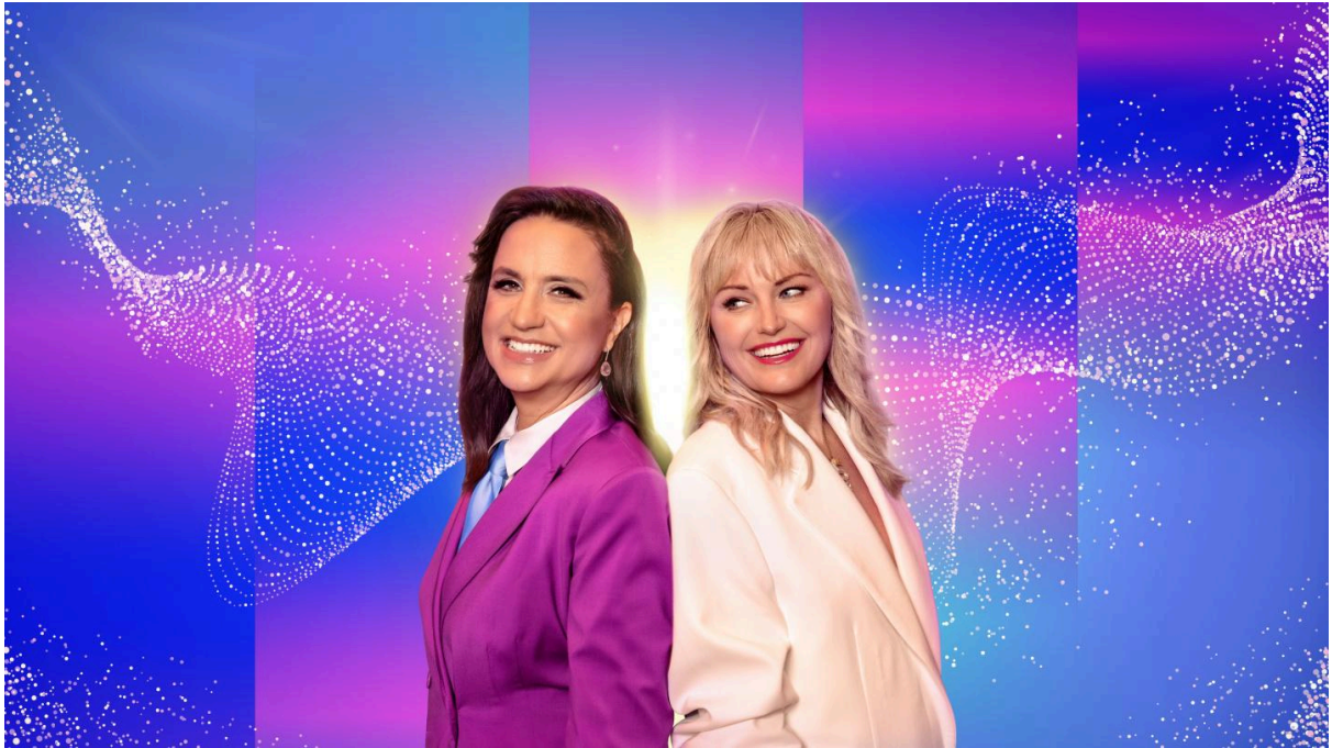
Petra Mede and Malin Akerman.